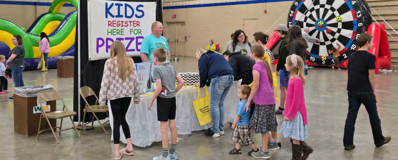
A room full of bouncy houses, other games and prizes will be available for kids.