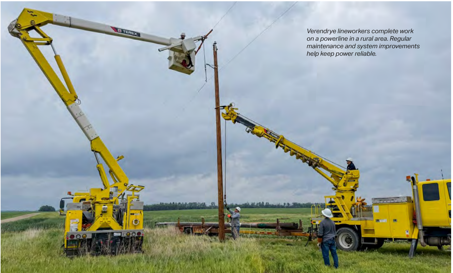
Verendrye lineworkers complete work on a powerline in a rural area. Regular maintenance and system improvements help keep power reliable.

The engineering department will continue to build upon the pace set in 2025. Our roadmap for the coming years will focus on system modernization, strategically installing underground cable, and technological integration. While we are proud to be a leader in utility technology, our progress is driven by people. The expertise of staff – past and present – along with the membership’s support, is truly what keeps the lights on. We aren’t just maintaining a grid; we are powering the homes, farms, and businesses that make our community thrive. ■