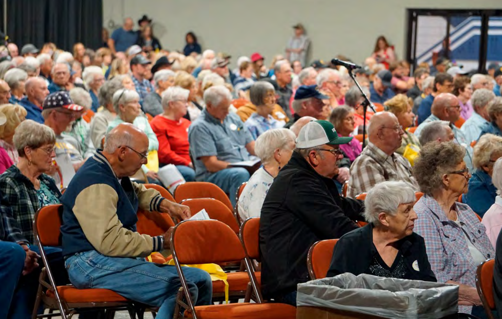
Verendrye members have a voice at the annual meeting where they get to vote for directors and give their input.