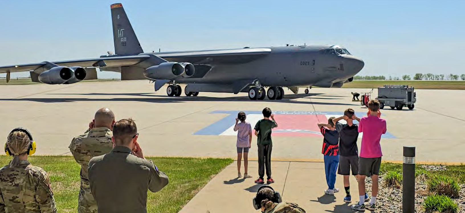
A B-52 Stratofortress readies for takeoff on the flightline at Minot Air Force Base. Verendrye powers the base and part of the missile field. Verendrye provides the base with reliable power and is a proud sponsor of events that help the men and women serving their country.